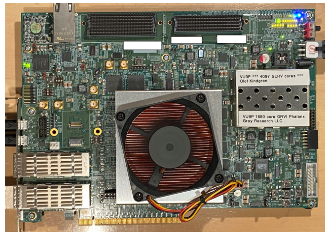
Fig. 2. VCU118 board used to break two world records. Running 1680 GRVI cores in 2016 and 4097 SERV cores in 2020