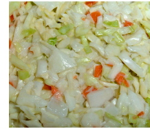
Fig. 1. Cole Slaw. Not to be confused with Moore’s law

Microprocessor architects report that semiconductor advancement has slowed industry-wide since around 2010, below the pace predicted by Moore’s law. In 2015, Gordon Moore foresaw that the rate of progress would reach saturation: “I see Moore’s law dying here in the next decade or so.” However, as of 2018, leading semiconductor manufacturers have IC fabrication processes in mass production with 10 nm and 7 nm features which are claimed to keep pace with Moore’s law.